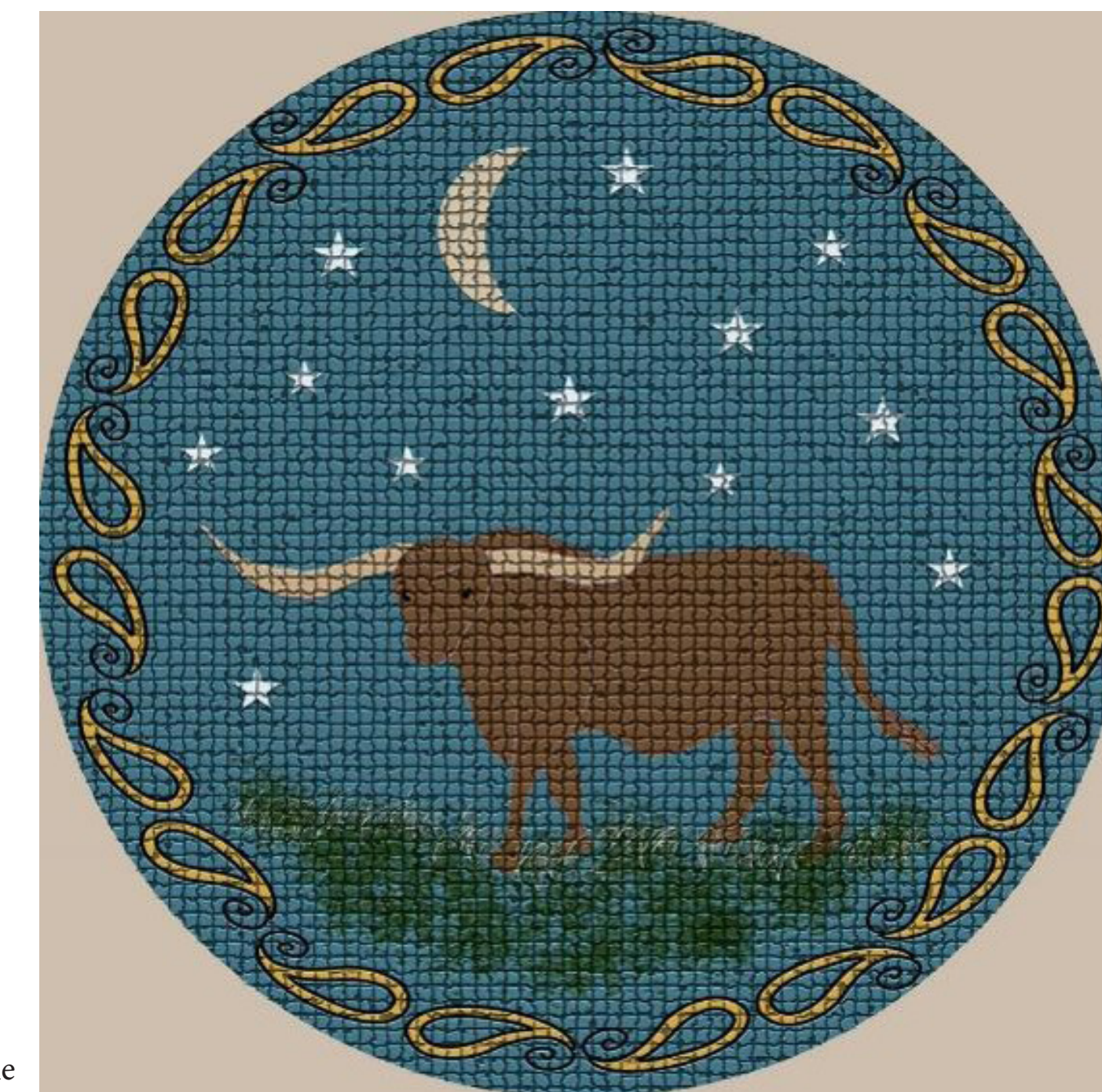
Medallion in Glass Tile