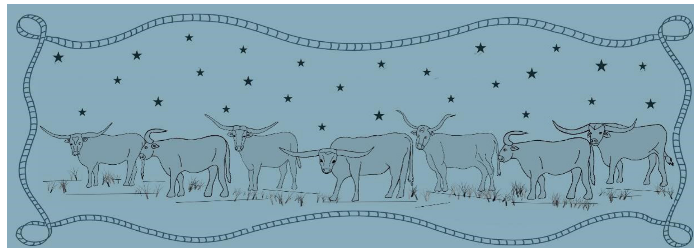
Form Liner Panel #2 Detail