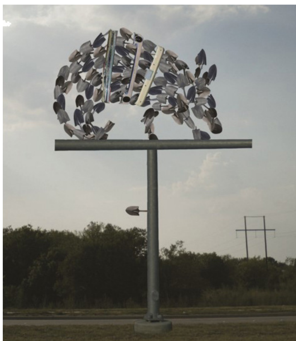
Shovel Armadillo Weather Vane

MEETING DETAILS: Monday, February 5th 6:30 PM Heritage Church of Christ 4201 Heritage Trace Pkwy. Fort Worth, Texas 76244