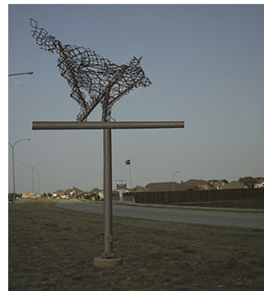
Chain Link Coyote Weather Vane