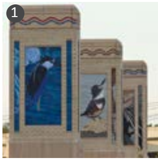
1 Trinity Water Fowl, 2015 Norie Sato Glass and Stone Mosaic

Chisholm Trail Parkway East Clearfork Crossing Bridge FWPA Commission