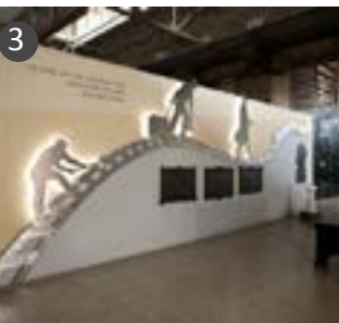
3 Freedom Train, 2010 Jeff Gottfried Sculpture (Stainless, Bronze, LED) 221 W Lancaster Avenue, 76102 Historic T& P Lofts (Breezeway) FWPA Commission