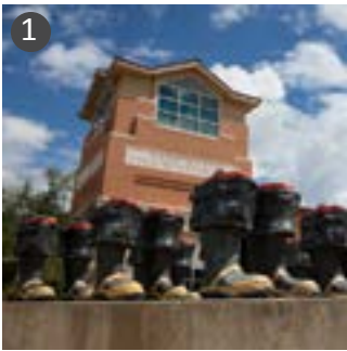
1 United We Stand , 2006 Eric McGehearty Bronze 1101 12th Avenue, 76110 Fire Station #8 FWPA Commission