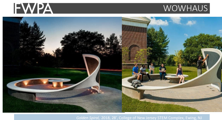
Golden Spiral, 2018, 28', College of New Jersey STEM Complex, Ewing, NJ