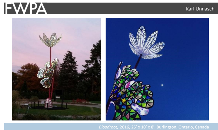
Bloodroot, 2016, 25' x 10' x 8', Burlington, Ontario, Canada