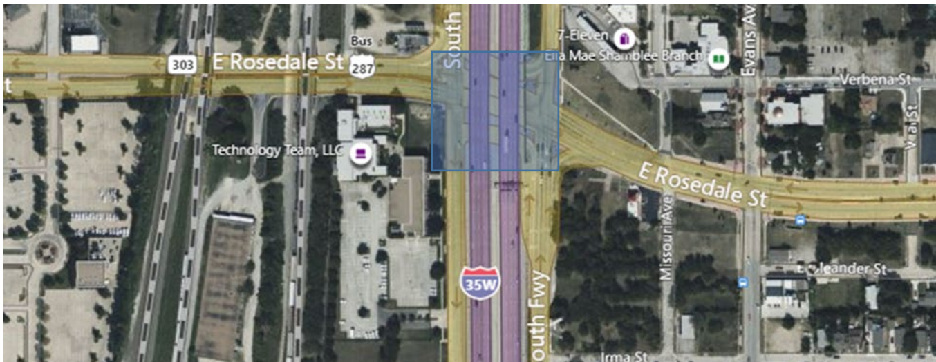
Artwork location for the East Rosedale Gateway Underpass

Upon the Fort Worth Art Commission's approval of the Final Design, an M&C will be taken to City Council to authorize an artwork commission contract with the Artist for fabrication, transportation and installation of the artwork.