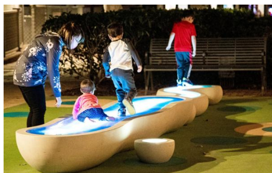
Finalist: Falon Mihalic