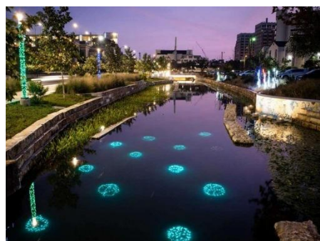
Alternate: Ansen Seale