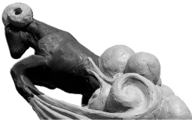
Detail of Conceptual Proposal