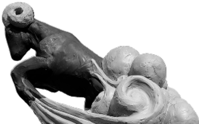
Detail of Conceptual Proposal