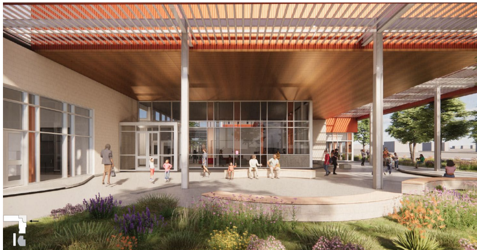
MLK Jr. Community Center Replacement and Aquatics Center | Public Art